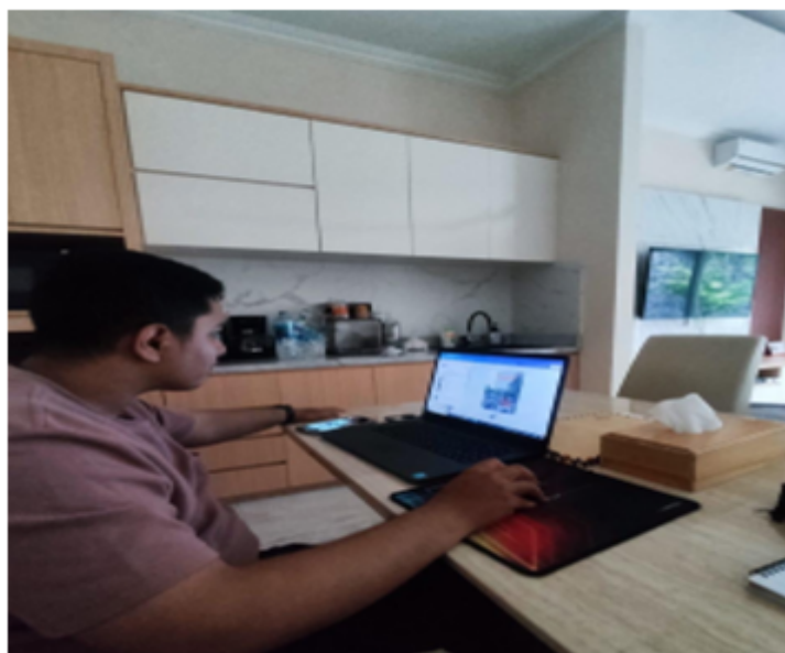
Figure 1. Discussion with the Supervisor of Kopi Ngaso

Instagram. This is proven to increase efficiency and improve experience customers in interacting with Kopi Ngaso. The following is a description of the implementation of the internship at Kopi Ngaso.