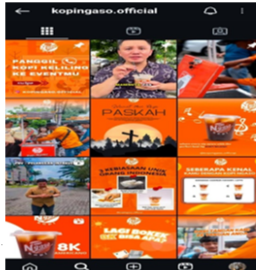
Figure 4. Appearance Instagram Coffee Ngaso

Previous customers had difficulty in finding Information. These results show that design can be a very useful tool in increasing followers and optimizing business processes. for UMKM such as Kopi Ngaso . The following is the final result of the display Instagram coffee ngaso.