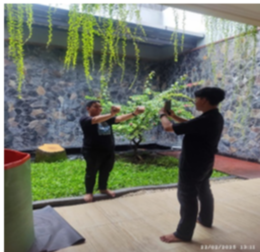
Figure 3. Make Content For Kopi Ngaso Design Needs

In this picture 2, the practitioner create a design using canva and make tiktok, On because ngaso coffee doesn't have tiktok yet for means promotion. During monitoring, Partners report that they feel helped and with the presence of promotion tiktok make coffee drunk better known more.