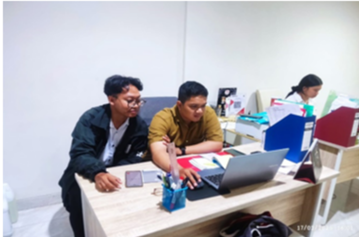
Figure 2. Creating Designs And Tiktok With The Kopi Ngaso Team

In this picture 1, the practitioner looking for information about ngaso coffee and the supervisor gave direction for create a design with a theme and colors that match Kopi Ngaso.